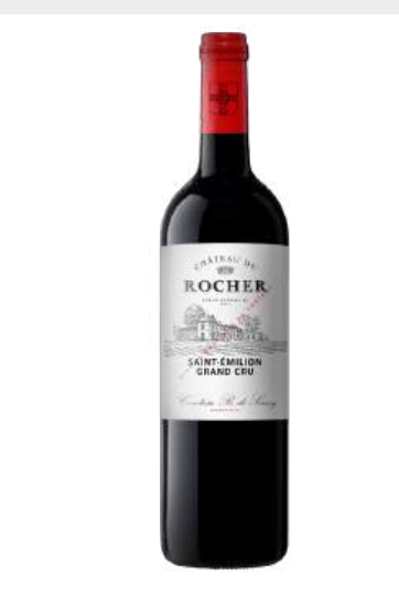
Château du Rocher Saint-Emilion Grand Cru